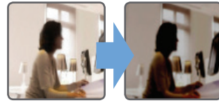
An abrupt decline in light output due to breakdown or failure of the product or any of the components in the system

Besides lumen maintenance (Useful Life), there are other factors to consider when evaluating performance over life.