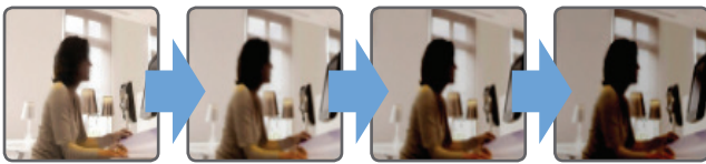
A gradual lowering of the light output and loss of efficiency

The gradual light output degradation of a population of LED based lighting products at a certain point in time is called Useful Life and is generally expressed as L_xB_y . Useful Life describes the lumen maintenance of a LED based luminaire over time.